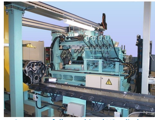
Cast Iron - fully machined V8 cylinder block - automatic linear transfer